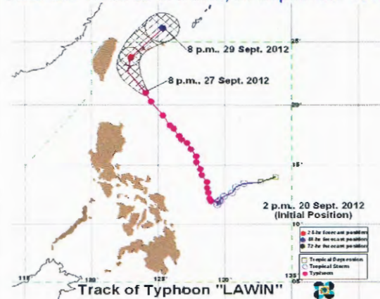
PAGASA Track as of 2 a.m., 28 September 2012