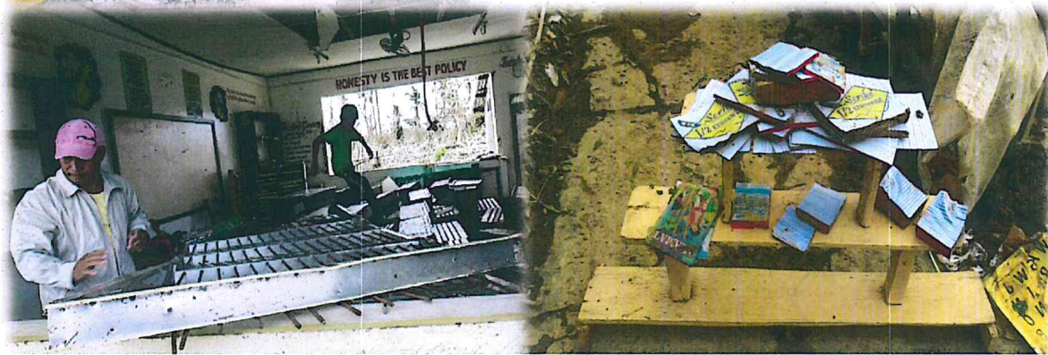
Damages incurred in schools in Regions I and III