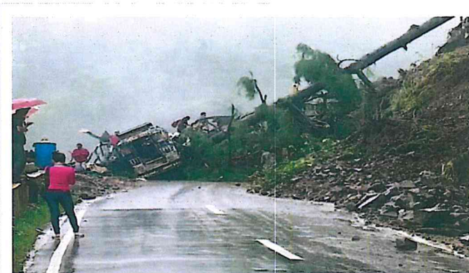
Landslide with four fully grown pine trees closed Kennon Road

A total of 148 roads and 37 bridges were rendered not passable due to flooding, landslides, toppled trees, and debris flow in Regions, I, II, III, V, and CAR