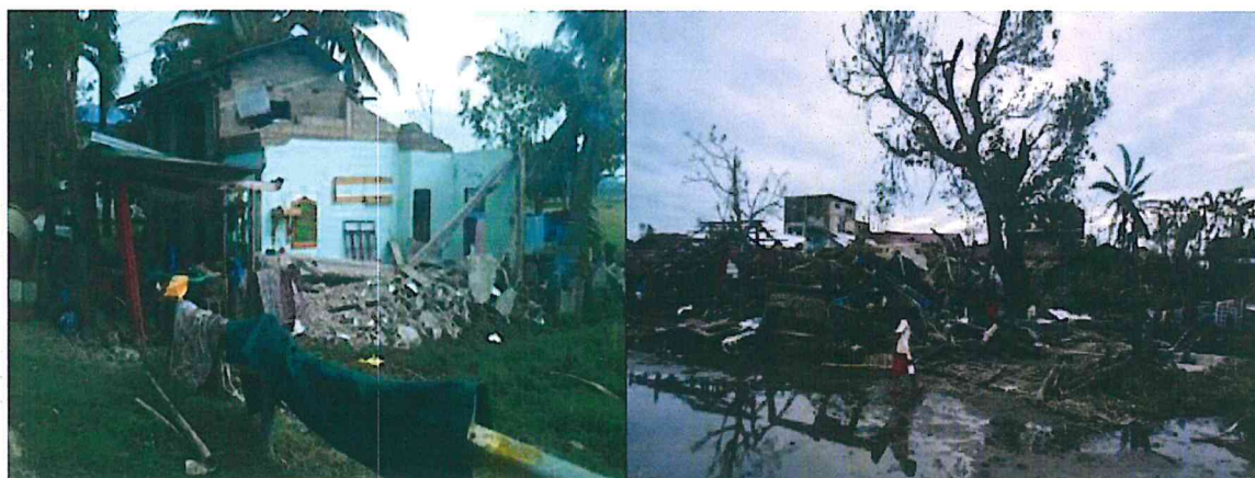
Damaged Houses in Regions I and III