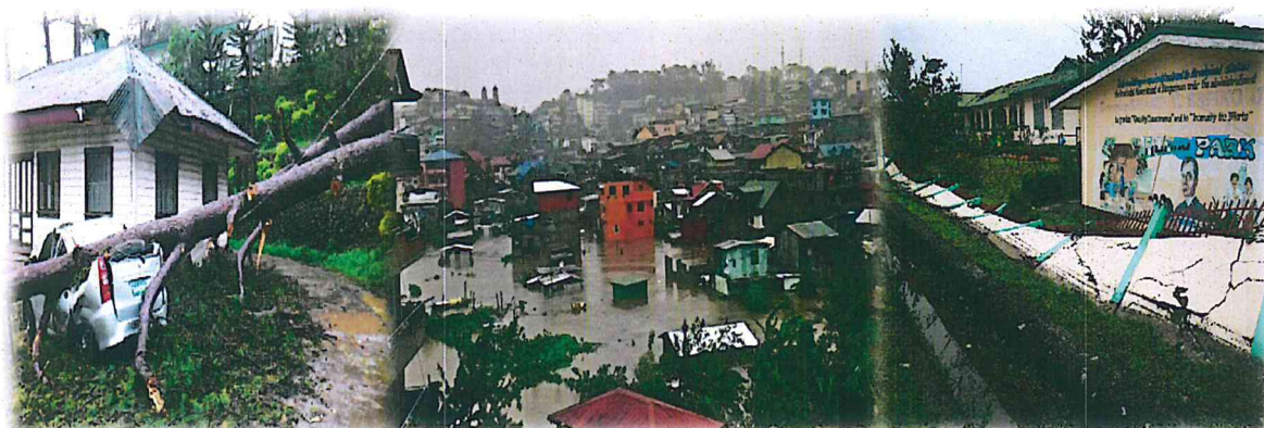
Incidents monitored in the province of Pangasinan and Baguio City due to TY Lando.