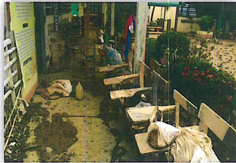
Flooded school in Region I