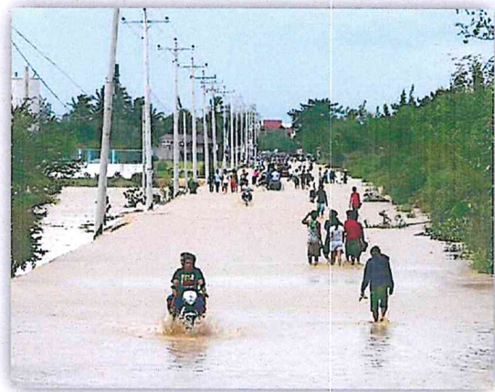
People crossing a flooded street in Zaragosa, Nueva Ecija.