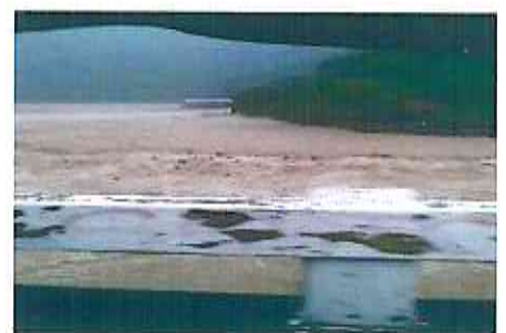
Gabaldon, Nueva Ecija as of 16 December 2015