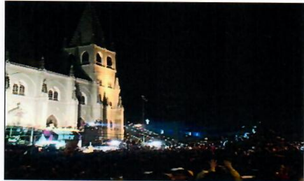
Black Nazarene in front of San Sebastian Church for "Dungaw"