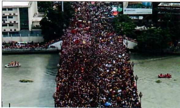
Multitude of devotees passing along Jones Bridge at 1:30 PM on 9 January 2015