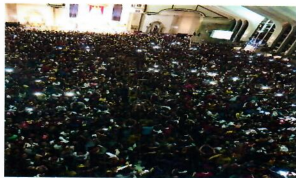
Black Nazarene and Devotees already inside Quiapo Church for the mass after more than 20 hours of procession