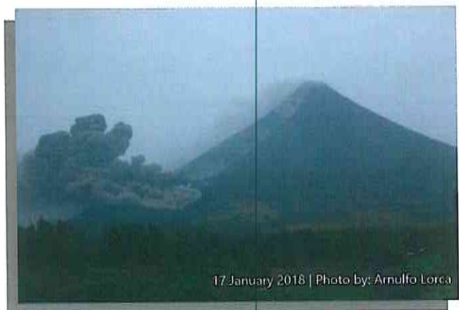
17 January 2018 | Photo by: Arnulfo Lorca

Lava effusion from the new summit lava dome and lava collapse events characterized Mayon Volcano's eruptive activity in the past 24 hours. One hundred forty-three (143) lava collapse events and one (1) tremor were recorded by Mayon's seismic monitoring network. The lava collapse events corresponded to rockfall along the front and margins of advancing lava and pyroclastic flows downriver of Miisi, Matanag, and Buyuan Gullies within the Permanent Danger Zone (PDZ).