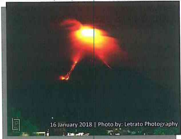
16 January 2018 | Photo by: Letrato Photography

A total of nine (9) episodes of tremor, four (4) of which accompanied short-duration lava fountaining, and 75 lava collapse events, corresponding to rockfall along the front and margins of advancing lava and short pyroclastic flows downriver of Miisi Gully within the PDZ were recorded by Mayon's seismic network. Collapse events and some degassing events at the summit crater generated ash that rose to 2 km and fell on barangays of Camalig, Guinobatan, and Polangui. Lava flow on the Miisi Gully has presently advanced to approximately 2km from the crater, while shorter volume lava flows have been emplaced on the upper slopes of the Bonga Gully.