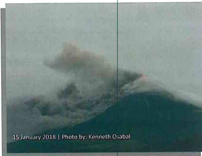
15 January 2018 | Photo by: Kenneth Osabal

At 11:43 AM, another phreatic eruption occurred that lasted approximately 15 minutes based on seismic record. The event produced ash plume that was largely obscured by summit clouds. Sulfuric odor was detected in and traces of ash fell on Camalig, Albay. For the past 24 hours, Mayon Volcano has noticeably increased its unrest.