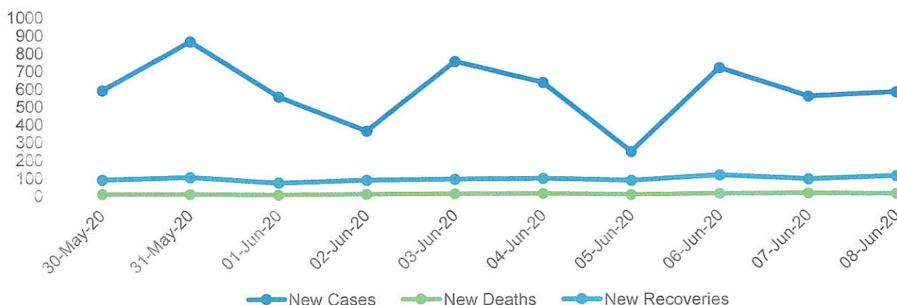
Trends in terms of New Confirmed Cases, Deaths, and Recoveries

Sources: Close Contacts c/o Regional Task Forces through OCD; Suspected and Probable Cases c/o DILG; Confirmed Cases, Deaths and Recoveries c/o DOH Note: The increase/decrease is due to continuous monitoring and validation.