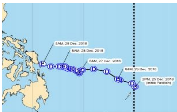
Fig. 2. DOST-PAGASA warning best track of Tropical Depression USMAN. The low-level circulation center of USMAN in (Fig. 1) is marked by a cyclone symbol.

45 km/h and central pressure of 1002 hPa as the system approached Palau. USMAN entered the PAR at 3:00 PM of the same day.