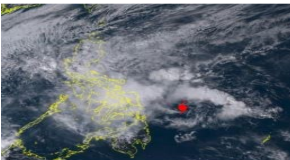
Fig. 1. Himawari-8 RGB composite image at 2:00 PM on 28 December 2018

USMAN developed from a tropical disturbance embedded within a near-equatorial buffer zone (Conover and Sadler 1960; Ramage 1995) situated over the western portion of the Caroline Islands. This disturbance was first noted on the surface weather chart in the afternoon of 23 December 2018. PAGASA first noted the disturbance as a tropical depression on 25 December 2018, 2:00 PM with maximum winds of