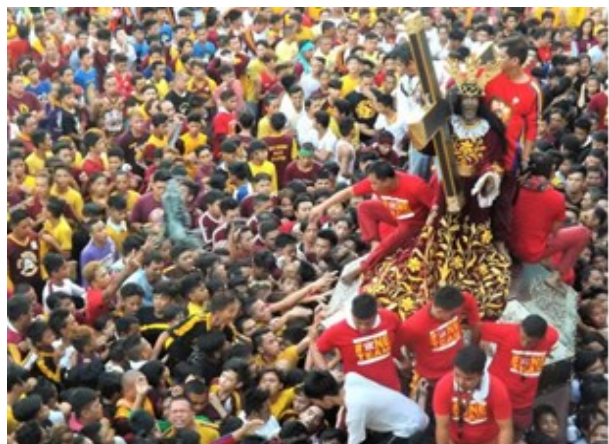
Replica procession in Quiapo

The procession is often marred by violent scuffles. This year, there were no reports of incidents following heightened security measures. Aside from the minor health issues recorded by the Department of Health, this year's feast of the Black Nazarene was generally peaceful.