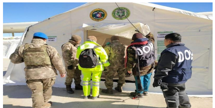
On 14 February 2023, the PEMAT continued its medical operations to accommodate the victims of the earthquake and the members of the contingent.