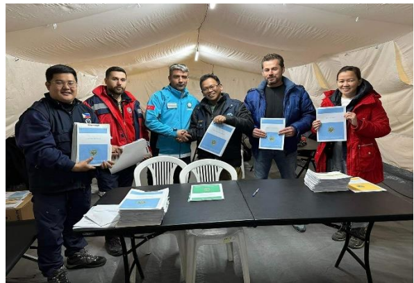
On 24 February 2023, the handover of list of donations and reports to MOH was conducted.