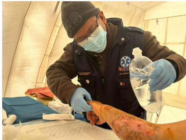
On 18 February 2023, the PEMAT continued its medical operations to accommodate the victims of the earthquake and the members of the contingent.