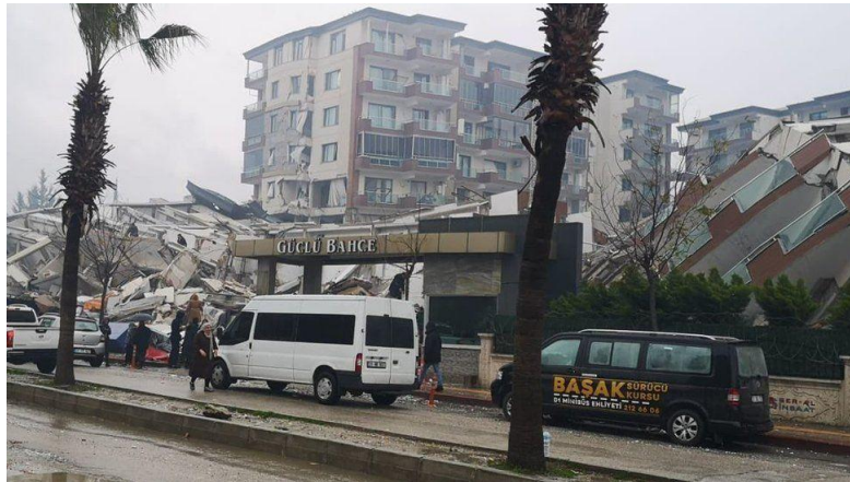
The Guclu Bahce complex in Antakya.