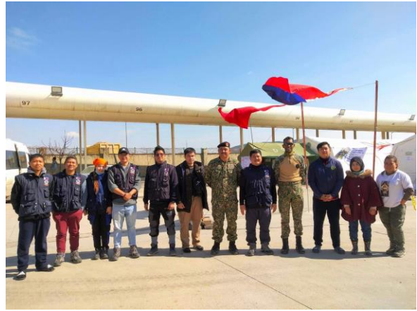
On 23 February 2023, the PEMAT field hospital was visited by the contingents from the Malaysian Field Hospital to share knowledge in field hospital management.