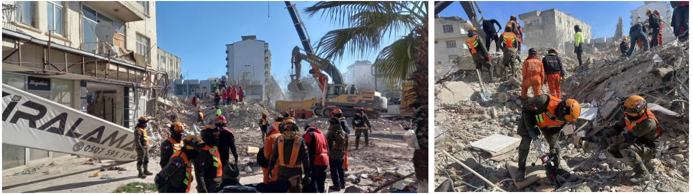
On 13 February 2023, Philippine USAR team geared up for SAR Operations on a collapsed apartment complex believed to house 100 persons.