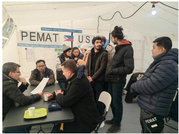
On 14 and 16 February 2023, the Turkish Ministry of Health/ UKME visited the PEMAT and USAR Team camp site.