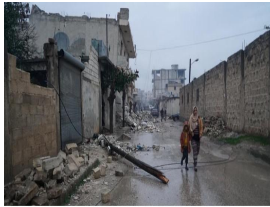
Mother and child walked hand-in-hand next to collapsed houses in North-west Syria. 8 February 2023.