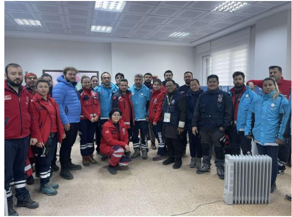
On 16 February 2023, PEMAT visited to the Adiyaman EMT Type 2 Setup of the Turkish Ministry of Health.