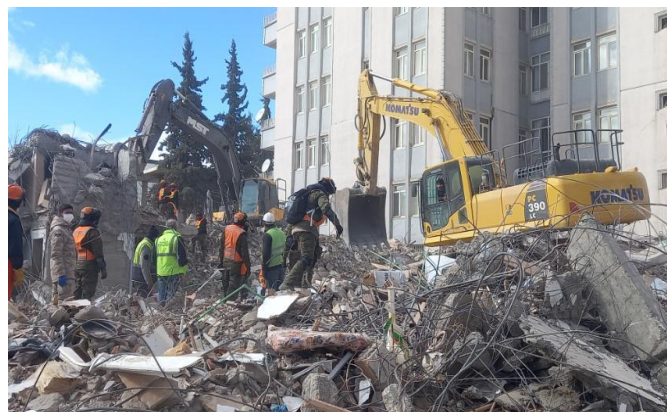
On 15 February 2023, PIAHC offered assistance on a new site to retrieve the remains of 3 persons.