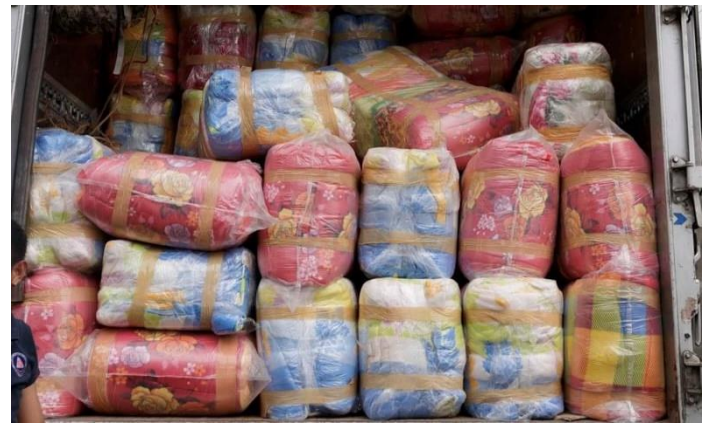
On 14 February 2023, the blankets donated by the Office of Civil Defense (OCD) arrived at the Staging Center of Turkey.