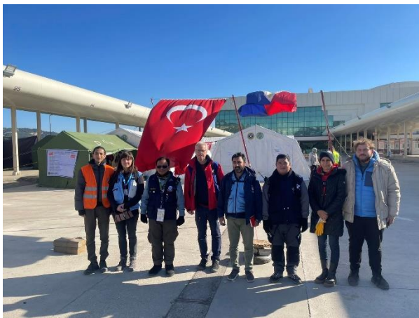
On 17 February 2023, Representatives from UNDAC visited the PEMAT and USAR Team camp site.