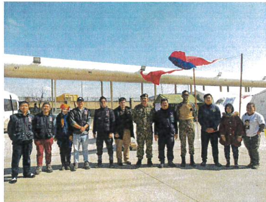
On 23 February 2023, the PEMAT field hospital was visited by the contingents from the Malaysian Field Hospital to share knowledge in field hospital management.