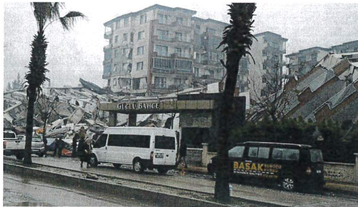
The Guclu Bahce complex in Antakya.