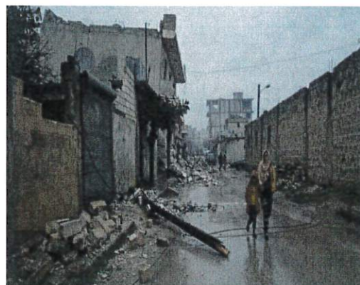
Mother and child walked hand-in-hand next to collapsed houses in North-west Syria. 8 February 2023.