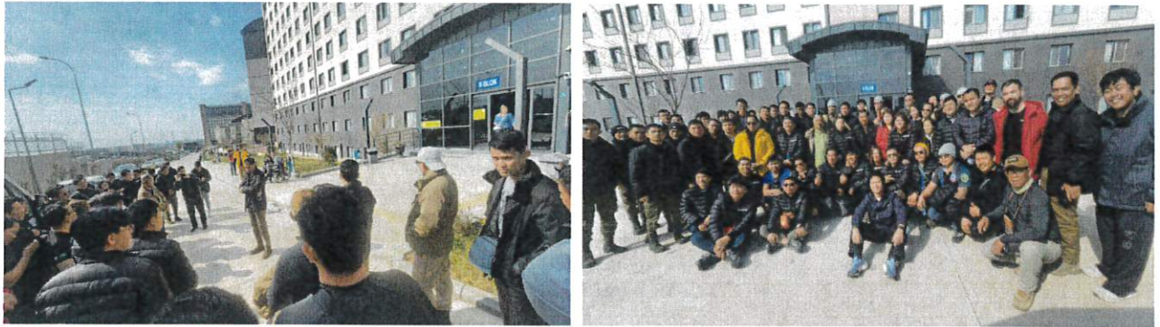
On 26 February 2023, Philippine Army, Philippine Defense and Armed Forces Attaché to Türkiye met with the Philippine Contingent to extend his appreciation and congratulations.