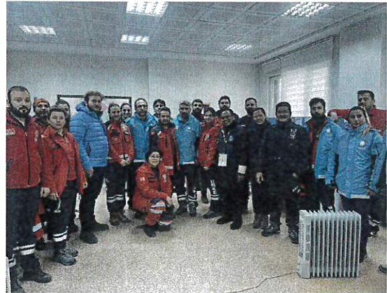
On 16 February 2023, PEMAT visited to the Adiyaman EMT Type 2 Setup of the Turkish Ministry of Health.