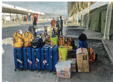
On 25 February 2023, PEMAT field hospital was being disassembled and decampment operations of the Philippine Contingent have started.