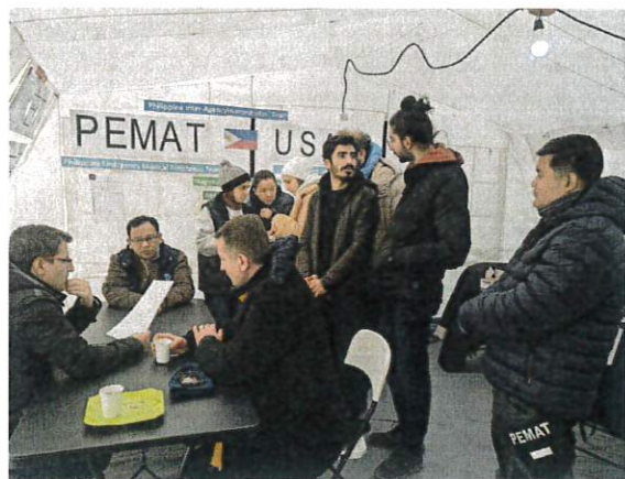
On 14 and 16 February 2023, the Turkish Ministry of Health/ UKME visited the PEMAT and USAR Team camp site.