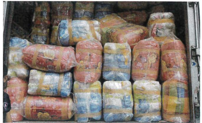
On 14 February 2023, the blankets donated by the Office of Civil Defense (OCD) arrived at the Staging Center of Turkey.