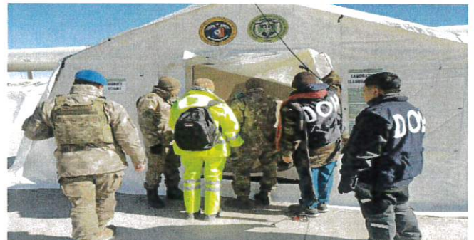
On 14 February 2023, the PEMAT continued its medical operations to accommodate the victims of the earthquake and the members of the contingent.