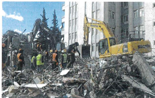
On 15 February 2023, PIAHC offered assistance on a new site to retrieve the remains of 3 persons.