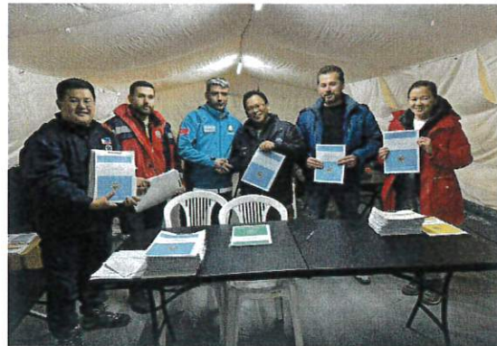
On 24 February 2023, the handover of list of donations and reports to MOH was conducted.