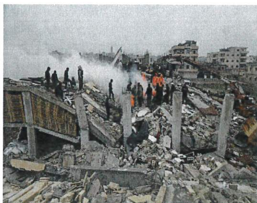
Collapsed building in Sarmada, North-west Syria. 6 February 2023.