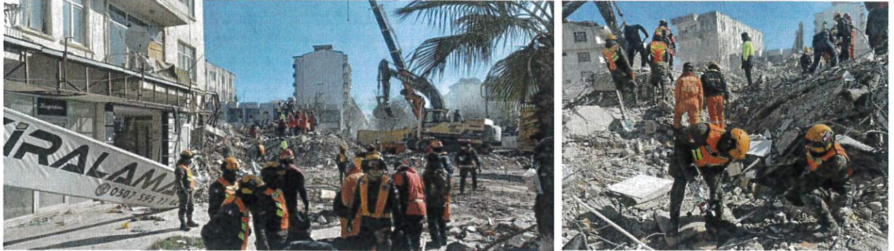
On 13 February 2023, Philippine USAR team geared up for SAR Operations on a collapsed apartment complex believed to house 100 persons.