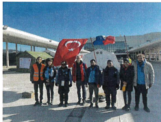
On 17 February 2023, Representatives from UNDAC visited the PEMAT and USAR Team camp site.