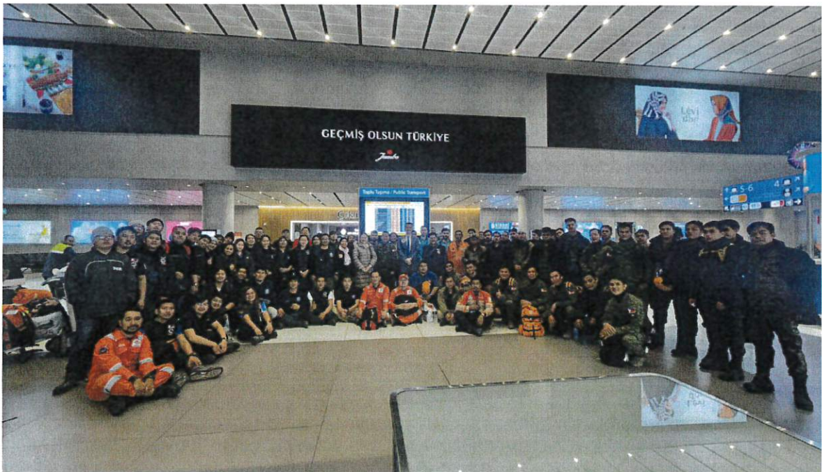
On 27 February 2023, around 1:22 AM, the PIAHC arrived at the Istanbul Airport.