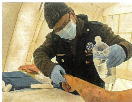
On 18 February 2023, the PEMAT continued its medical operations to accommodate the victims of the earthquake and the members of the contingent.