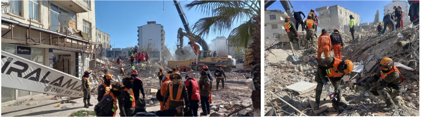
On 13 February 2023, Philippine USAR team geared up for SAR Operations on a collapsed apartment complex believed to house 100 persons.