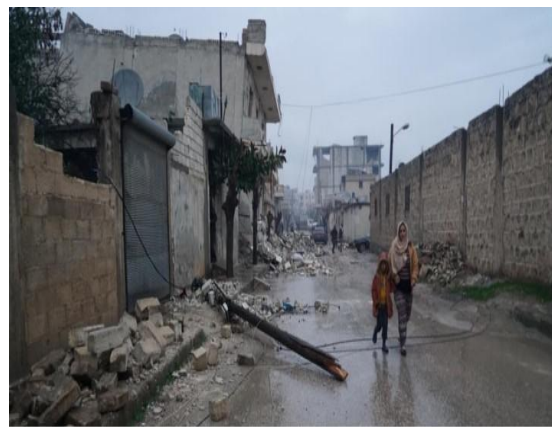
Mother and child walked hand-in-hand next to collapsed houses in North-west Syria. 8 February 2023.