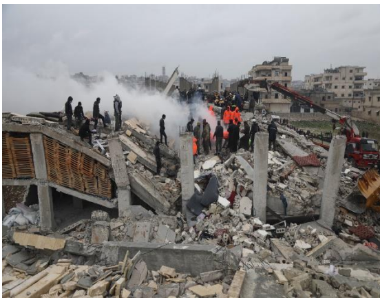
Collapsed building in Sarmada, North-west Syria. 6 February 2023.