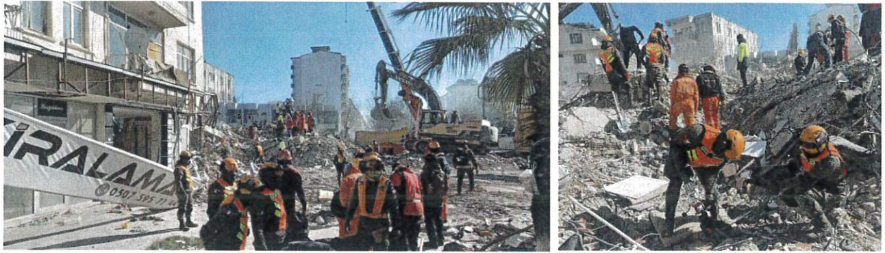
On 13 February 2023, Philippine USAR team geared up for SAR Operations on a collapsed apartment complex believed to house 100 persons.