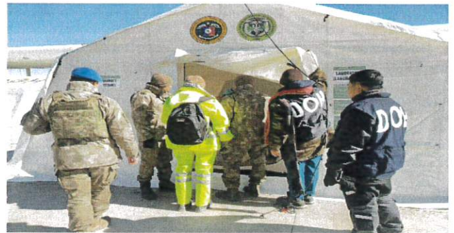
On 14 February 2023, the PEMAT continued its medical operations to accommodate the victims of the earthquake and the members of the contingent.