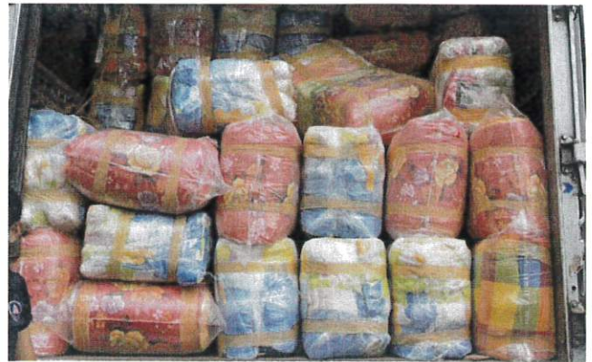
On 14 February 2023, the blankets donated by the Office of Civil Defense (OCD) arrived at the Staging Center of Turkey.