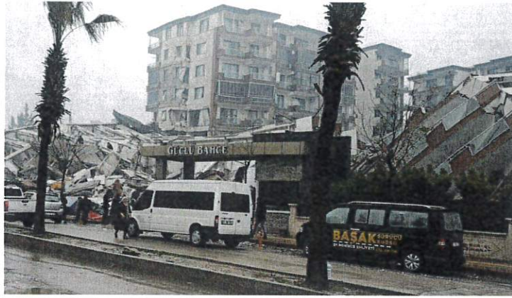
The Guclu Bahce complex in Antakya.