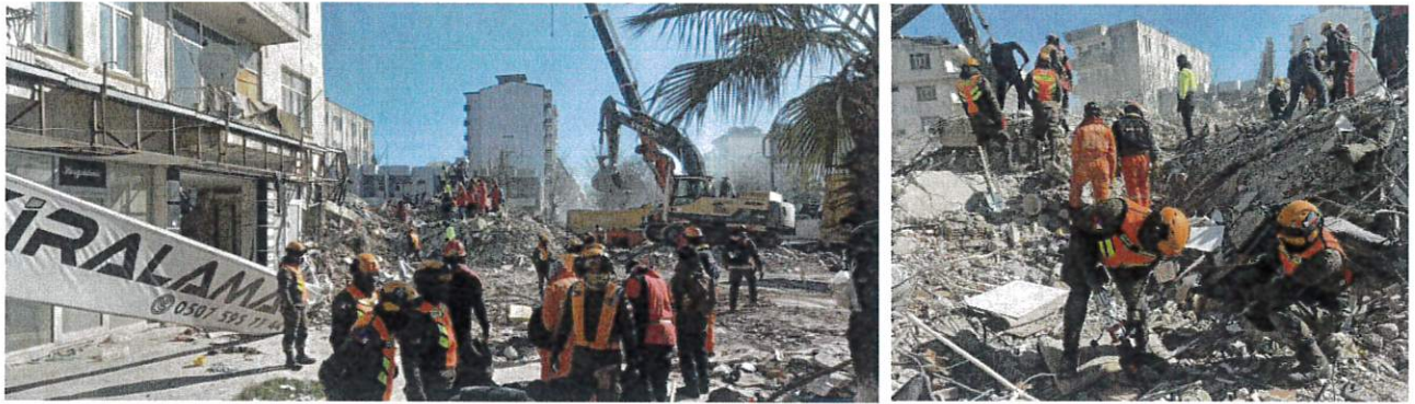
On 13 February 2023, Philippine USAR team geared up for SAR Operations on a collapsed apartment complex believed to house 100 persons.