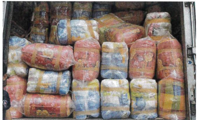
On 14 February 2023, the blankets donated by the Office of Civil Defense (OCD) arrived at the Staging Center of Turkey.