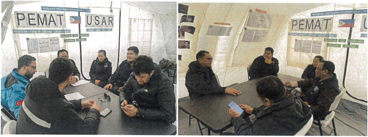
On 14 February 2023, 4th Camp visit of Ministry of Health/ UKME to camp site.