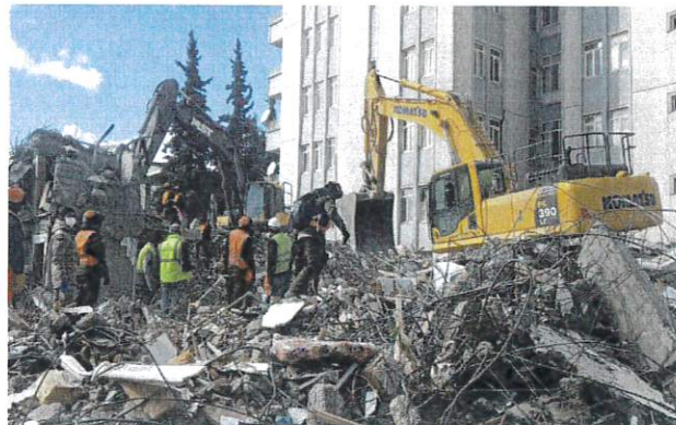
On 15 February 2023 PIAHC offered assistance on a new site to retrieve the remains of 3 persons.