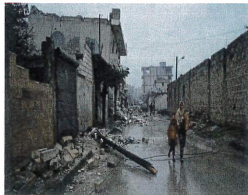
Mother and child walked hand-in-hand next to collapsed houses in North-west Syria. 8 February 2023.