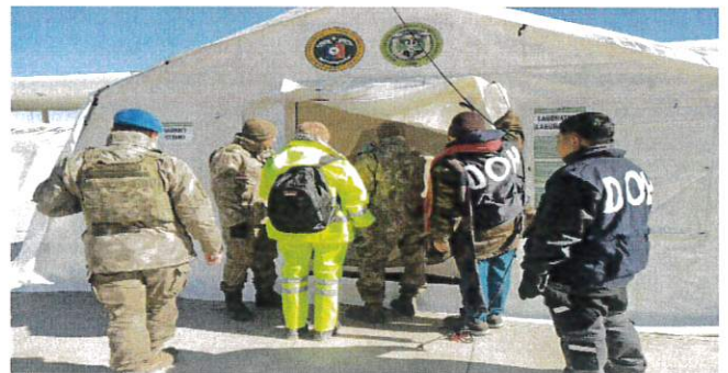
On 14 February 2023, the PEMAT continued its medical operations to accommodate the victims of the earthquake and the members of the contingent.