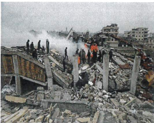
Collapsed building in Sarmada, North-west Syria. 6 February 2023.