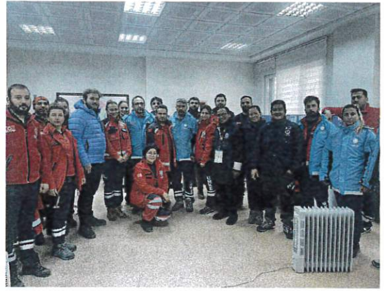
On 16 February 2023, PEMAT visited to the Adiyaman EMT Type 2 Setup of the Turkish Ministry of Health.