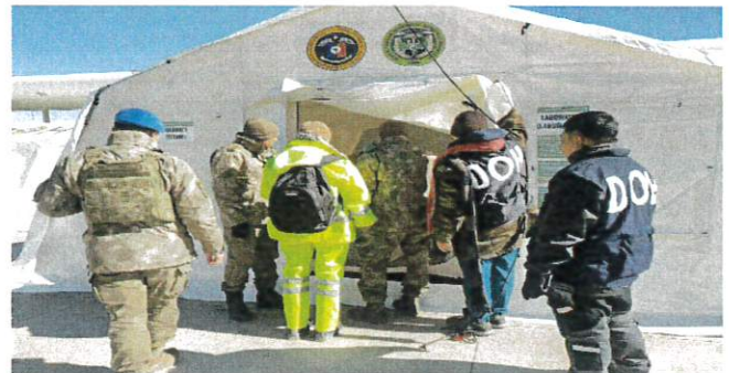
On 14 February 2023, the PEMAT continued its medical operations to accommodate the victims of the earthquake and the members of the contingent.