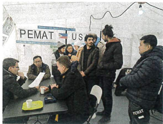
On 14 and 16 February 2023, the Turkish Ministry of Health/ UKME visited the PEMAT and USAR Team camp site.