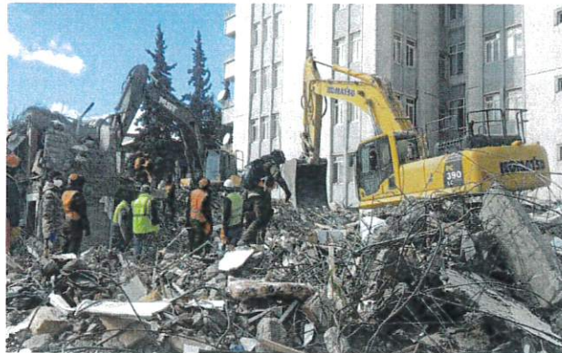
On 15 February 2023, PIAHC offered assistance on a new site to retrieve the remains of 3 persons.