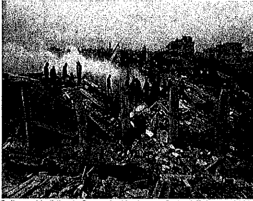
Collapsed building in Sarmada, North-west Syria. 6 February 2023.