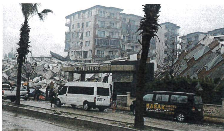
The Guclu Bahce complex in Antakya.