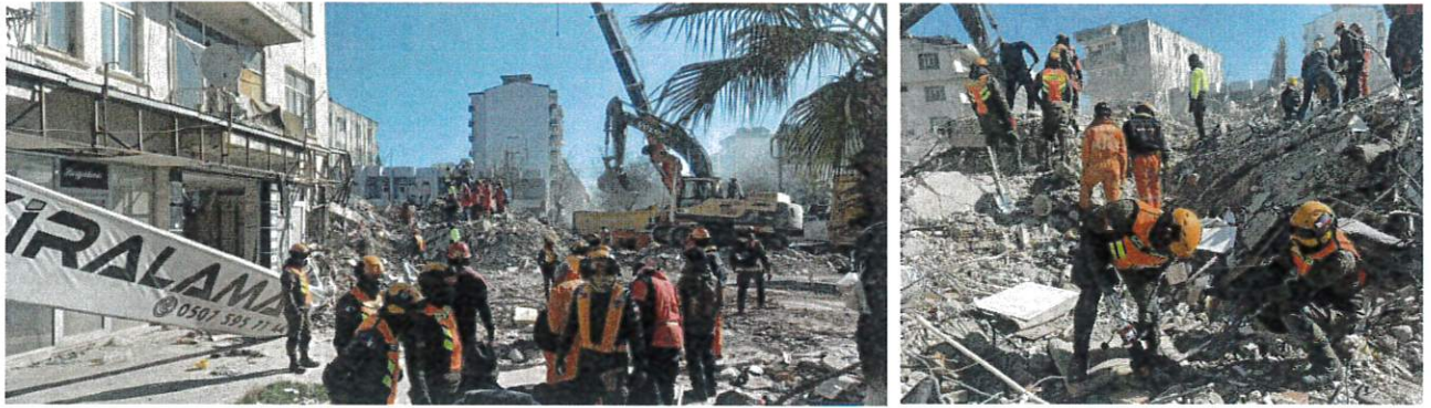
On 13 February 2023, Philippine USAR team geared up for SAR Operations on a collapsed apartment complex believed to house 100 persons.