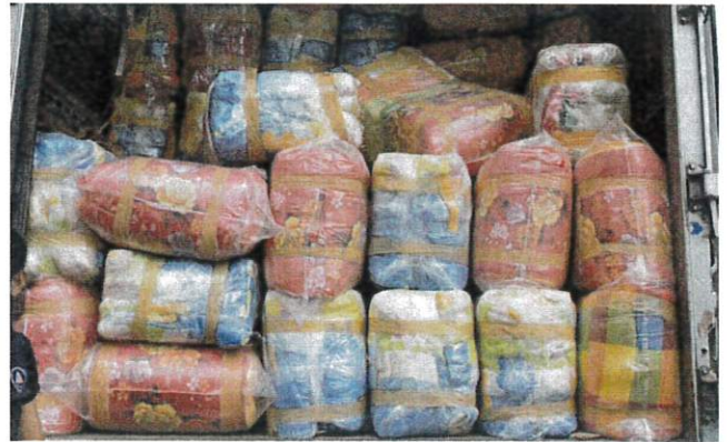
On 14 February 2023, the blankets donated by the Office of Civil Defense (OCD) arrived at the Staging Center of Turkey.