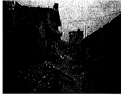
Mother and child walked hand-in-hand next to collapsed houses in North-west Syria. 8 February 2023.