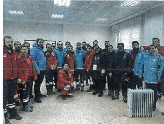
On 16 February 2023, PEMAT visited to the Adiyaman EMT Type 2 Setup of the Turkish Ministry of Health.