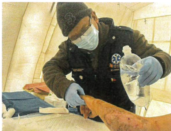
On 18 February 2023, the PEMAT continued its medical operations to accommodate the victims of the earthquake and the members of the contingent.