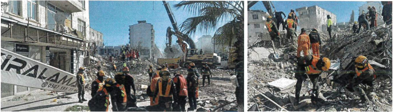
On 13 February 2023, Philippine USAR team geared up for SAR Operations on a collapsed apartment complex believed to house 100 persons.