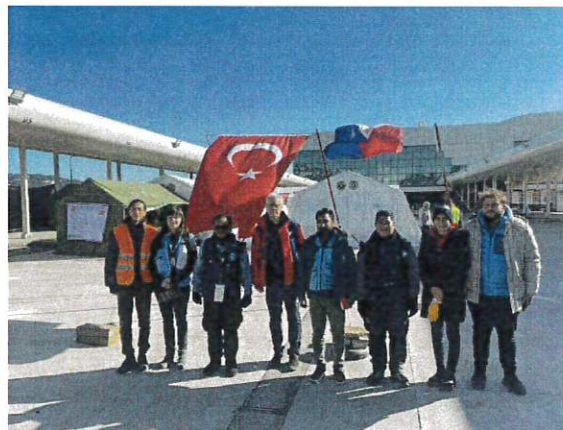
On 17 February 2023, Representatives from UNDAC visited the PEMAT and USAR Team camp site.