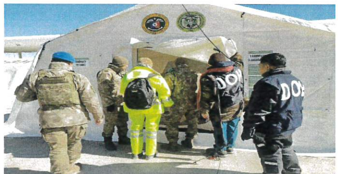
On 14 February 2023, the PEMAT continued its medical operations to accommodate the victims of the earthquake and the members of the contingent.