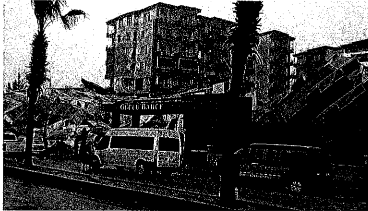
The Guclu Bahce complex in Antakya.