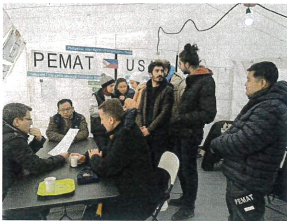
On 14 and 16 February 2023, the Turkish Ministry of Health/ UKME visited the PEMAT and USAR Team camp site.