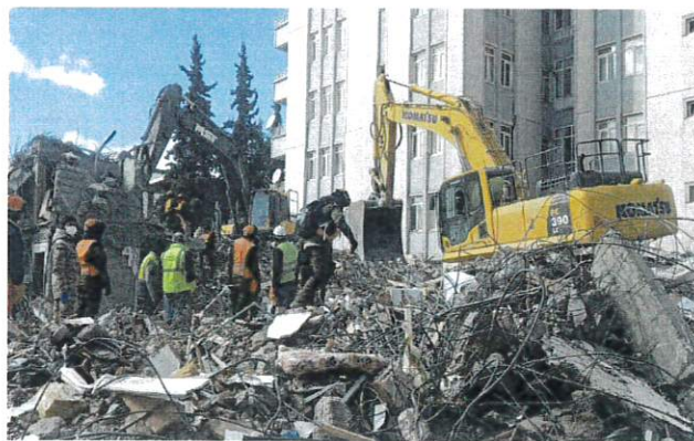
On 15 February 2023, PIAHC offered assistance on a new site to retrieve the remains of 3 persons.