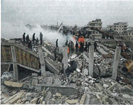
Collapsed building in Sarmada, North-west Syria. 6 February 2023.