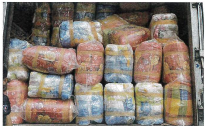
On 14 February 2023, the blankets donated by the Office of Civil Defense (OCD) arrived at the Staging Center of Turkey.