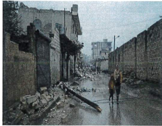
Mother and child walked hand-in-hand next to collapsed houses in North-west Syria. 8 February 2023.