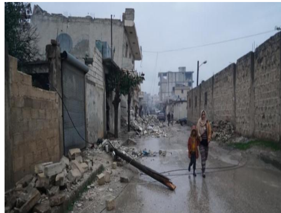
Mother and child walked hand-in-hand next to collapsed houses in North-west Syria. 8 February 2023.