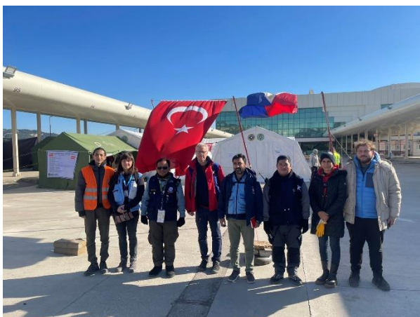
On 17 February 2023, Representatives from UNDAC visited the PEMAT and USAR Team camp site.